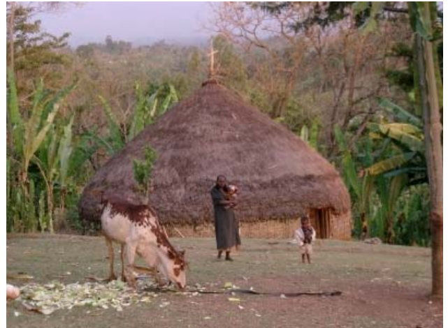
Yirga Alem House

This morning head for Gerra and the forest coffee area that is still owned by the family of the former king of the Kaffa region, Abba Jiffar. A member of the family will escort you around the estate including the Abajifar Museum and Palace. Return to Jimma and your overnight accommodation. (B,L,D)