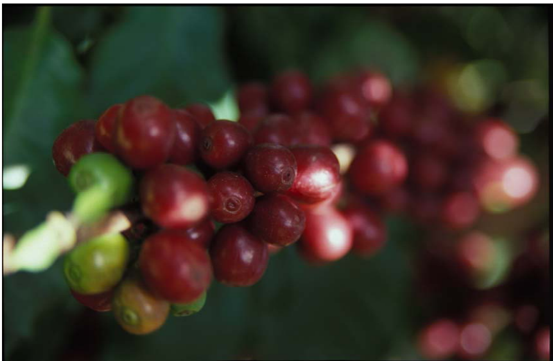
Coffee Cherries