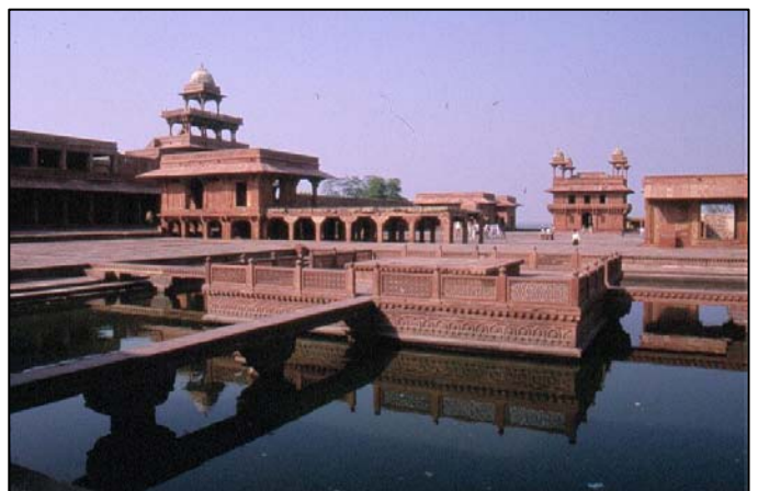
Fatehpur Sikri

Agra in terms of ambiance is still associated with its Mughal period. The Mughals, besides being great rulers, were also great builders and they preserved their best architectural wonders for Agra & its neighbourhood. It has many wonderful monuments and the Taj Mahal, the greatest of them all, is a masterpiece of Mughal architecture at its best. The massive but elegant Agra Fort, the delicate artistry of Itimad-ud-daulah's tomb, the magnificent Taj and Akbar's deserted capital, Fatehpur Sikri, are each unique and outstanding.