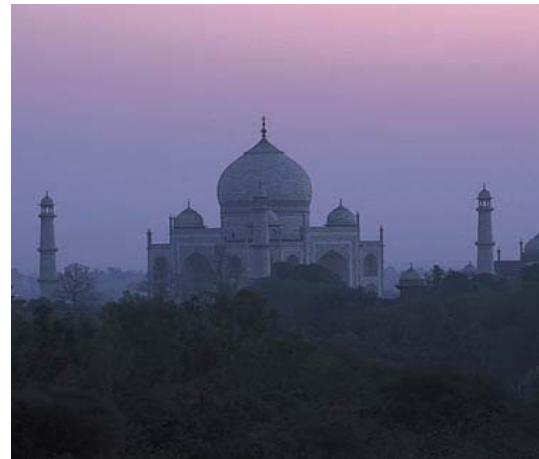
Taj Mahal

After check-in at your hotel loose yourself in the local marble and leather markets . Bargain at your best for the marble products and high quality leather wallets, shoes, belts etc. Also visit the " Petra Dura Workshop " their marble inlay is amongst the most renowned of India's handicrafts. There are some wonderful historic examples especially in the Taj Mahal. You will also have the opportunity to witness fine quality marble inlay work being done.