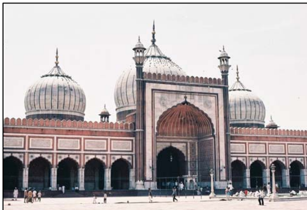
Jami Masjid

5,000 artisans from 1644 to 1656. The broad red sandstone steps lead up to gates at the east, north and south.