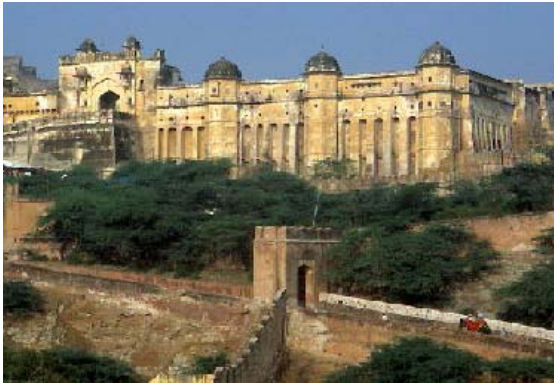
Amber Fort

After breakfast at the hotel, you will be driven to the ancient capital of Amber to see the fabulous Amber Fort. Maharaja Mansingh, Mughal Emperor Akbar's most successful General, started the construction of Amber Fort in the 17 th century. Before the City Palace was constructed in Jaipur, Amber was the seat of power. The fort is surrounded by fortified battlements and overlooks the Moat Lake. Ruins and remains are spread over the Aravalli hills and crenulated walls lattice the surrounding area.